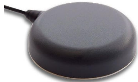
TW2743 Dimensions (mm)

The TW2743 is housed in a compact, industrial-grade weather-proof, magnet mount enclosure, with threaded base holes for screw down attachment.